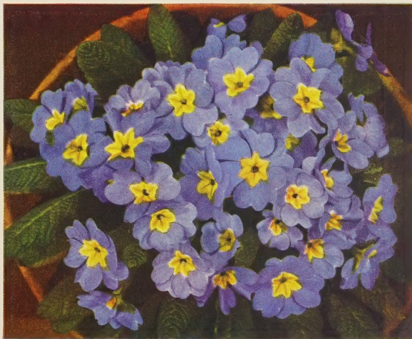
Blue Acaulis Primula